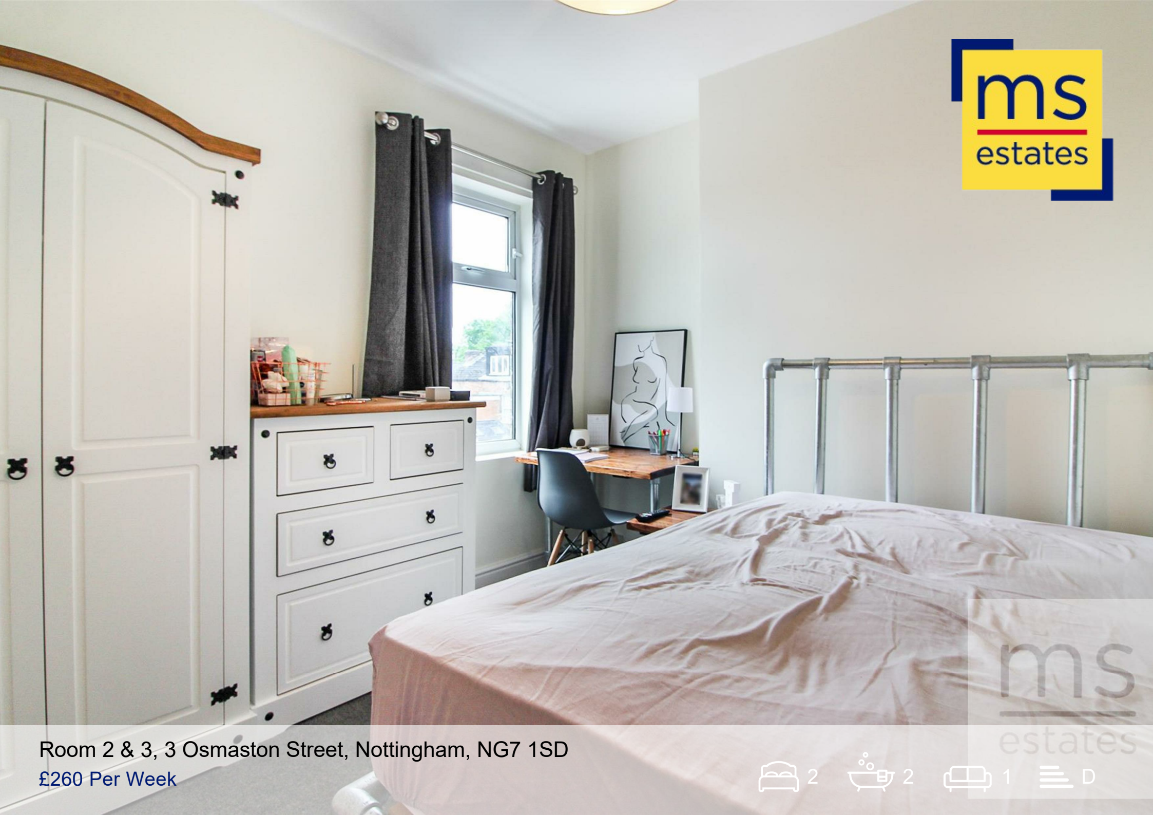
Room 2 & 3, 3 Osmaston Street, Nottingham, NG7 1SD £260 Per Week